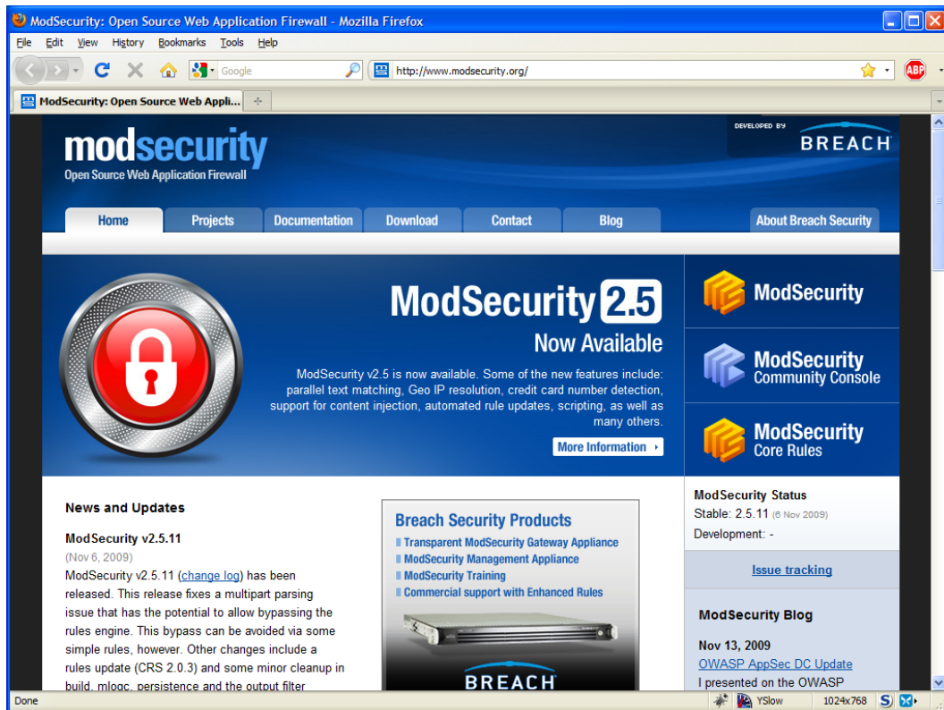
Figure 2-1. The homepage of www.modsecurity.org